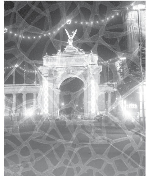
Photo: An example of a deteriorating negative from the CNE archival collection