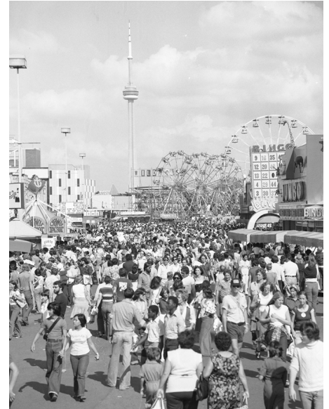
Photo: Crowds enjoying the CNE midway, 1977

Your support will help save these culturally and historically significant Canadian images, allowing the CNE's legacy to live on for all.