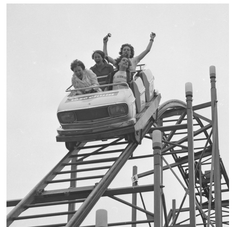
Photo: Summer fun at the Ex, 1972